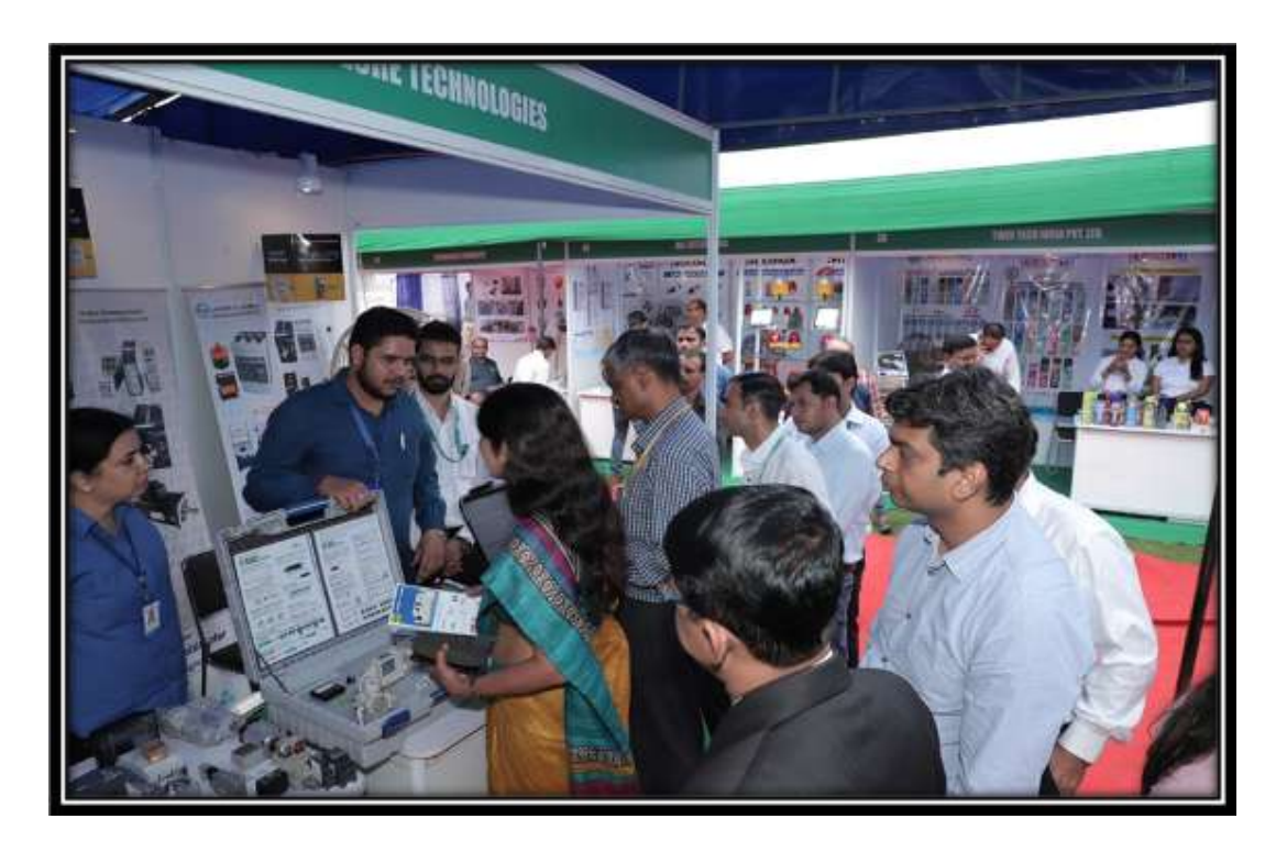
Dignitaries Interacting with Participants during National Vendor Development Programme.