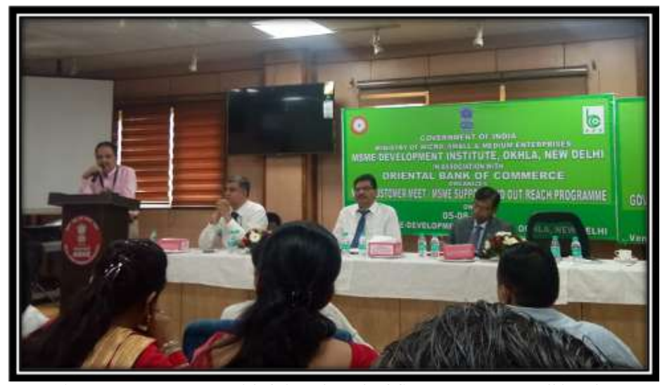
Awareness programme with Oriental Bank of Commerece, New Delhi under MSME Support & Outreach on 05.8.19

MSME- Development Institute has organized various awareness programmes cum loan melas in association with Bank of Baroda, Oriental Bank of Commerce, Allahabad Bank, Syndicate bank etc. under MSME Support and Outreach Programme in the conference hall of the Institute. Financial schemes of respective banks were also made aware to them. Sanctions letters were also distributed to beneficiaries during the programmes.