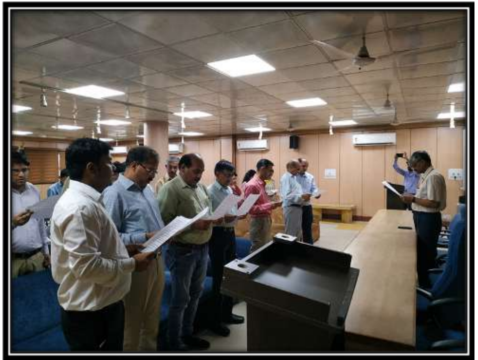
Officers taking the oath of Swachchta

Various activities were conducted during the swachchta pakhwada by the officers of the institie from 15^{\text{th}} June to 30^{\text{th}} June , 2019. Some glimpses are as follows:-