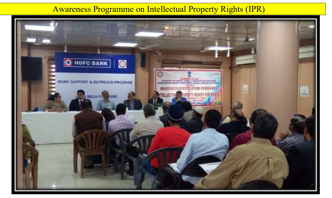
Speakers Interacting with the participants during the Programme on 5<sup>th</sup> March, 2020 at MSME-DI, Okhla, New Delhi