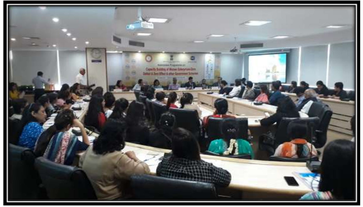
View of Participants attending the programme