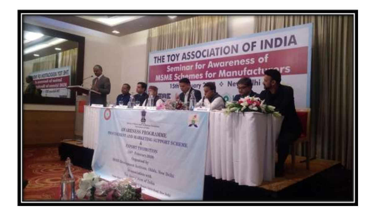
Director, MSME –DI, New Delhi addressing the participants during the Programme