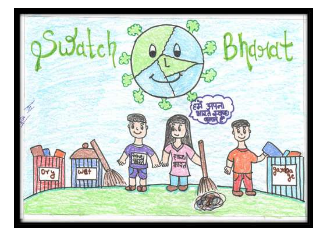
Glimpse of the Art work done by the children