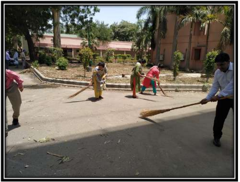
Swachchta Campaign in the premises of Office