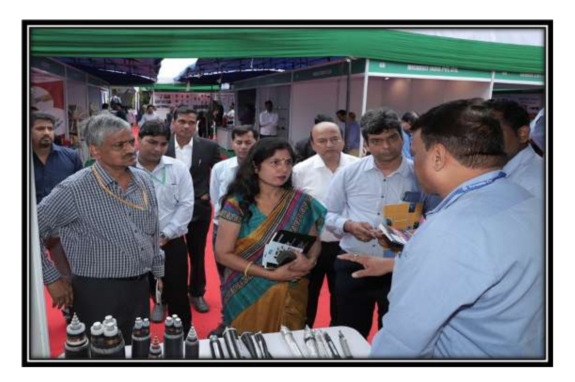
Dignitaries Interacting with Participants during National Vendor Development Programme.