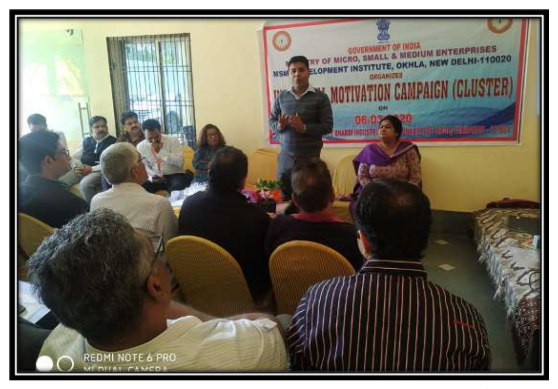
Officer, MSME-DI, ND giving presentation on MSME Schemes During IMC Cluster on 6<sup>th</sup> March, 2020 at Bhakri Indl. Area, Faridabad