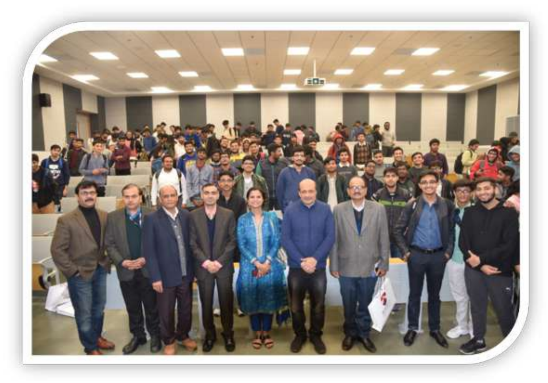
Participants attending the IMC Youth programe at at Bennett University, Greater Noida on 06<sup>th</sup> To 07<sup>th</sup> February, 2019.