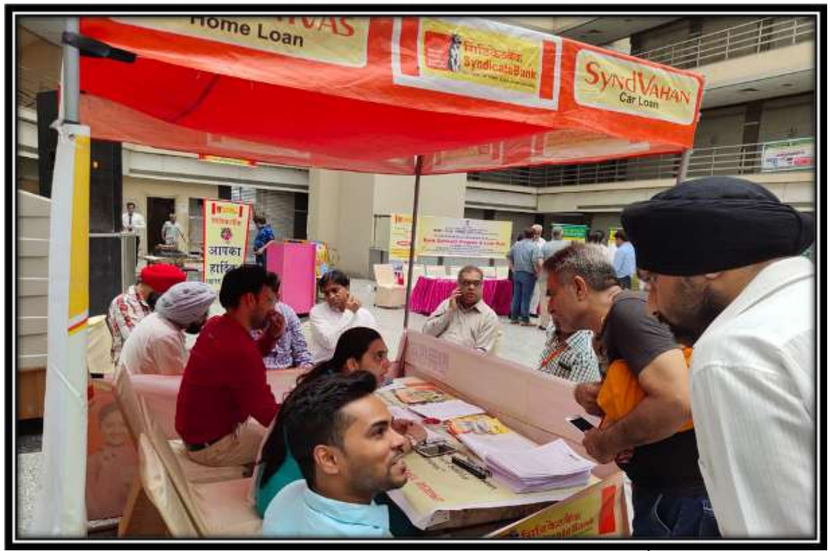
View of Bank officers explaining the loan sechemes during Loan Mela on 27<sup>th</sup> May, 2020