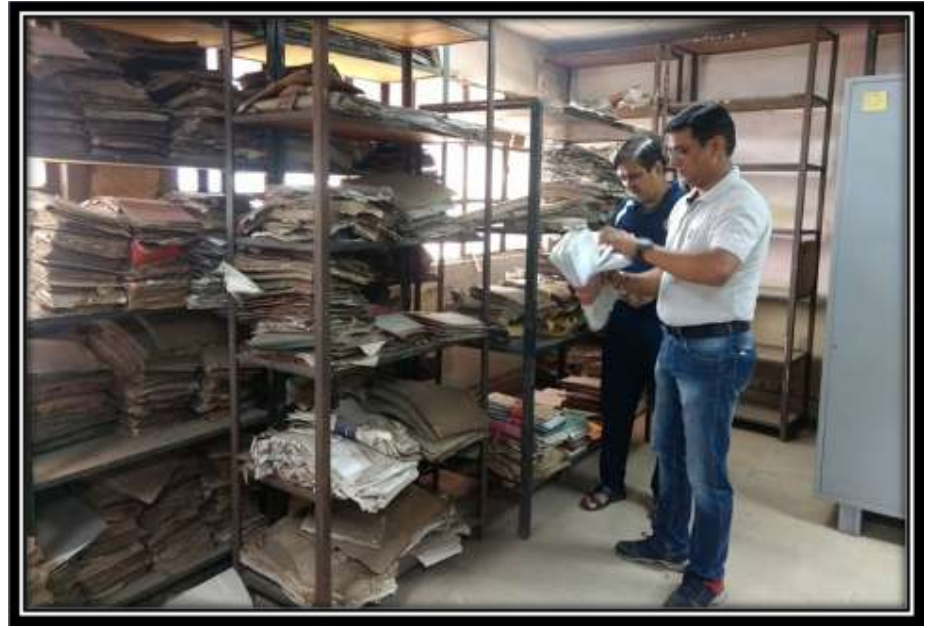
Cleaning the Record Room