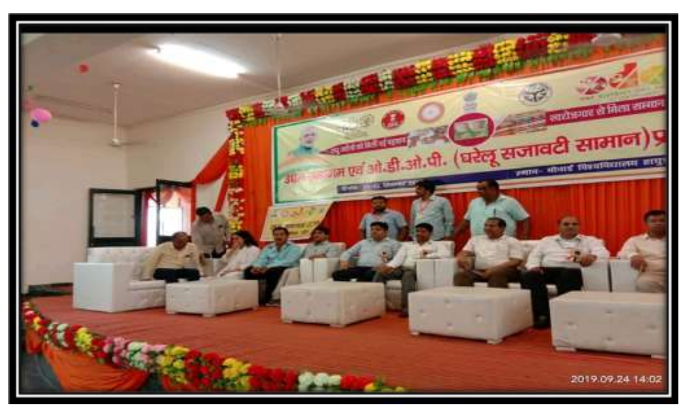
Dignitaries sitting on the Dias during the event at Hapur