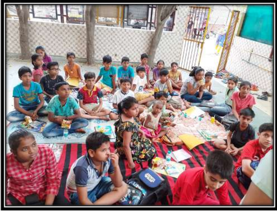
Swachchta activity in the School